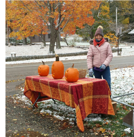
Lighting of the Pumpkins.