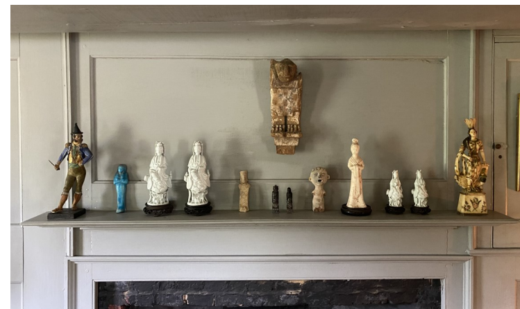
Figures on the Perkins House parlor mantle, collected by family members on world travels from 1909 to 1943, and known to have been in the room until 1952. They are from Spain, Egypt, China, Greece, Mexico, and Peru.