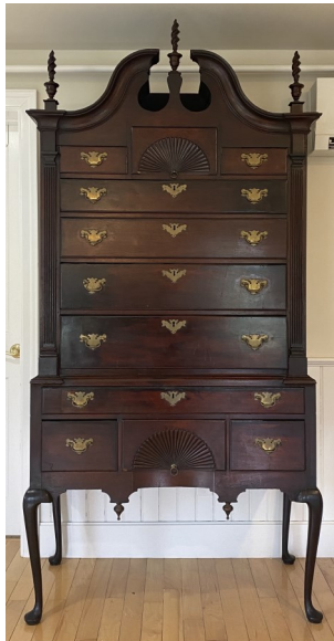
An 18th century Massachusetts highboy returned in 2020 to the Perkins Collection by the Warner House Association.