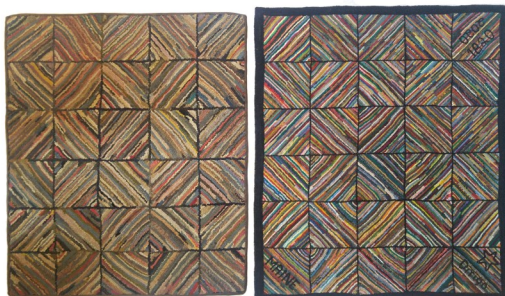
An early 20th century hooked rug (left) from the Historic Landmarks Collection, and a reproduction made by the Seacoast Ruggers.