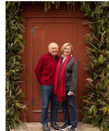
Yuletide Photos at Jefferds Tavern.