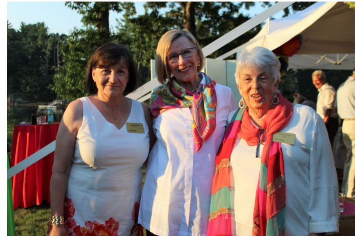
Fiesta by the River Fundraising Party