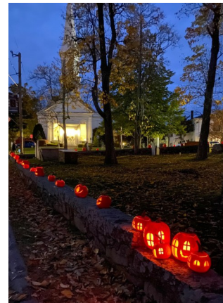
Lighting of the Pumpkins