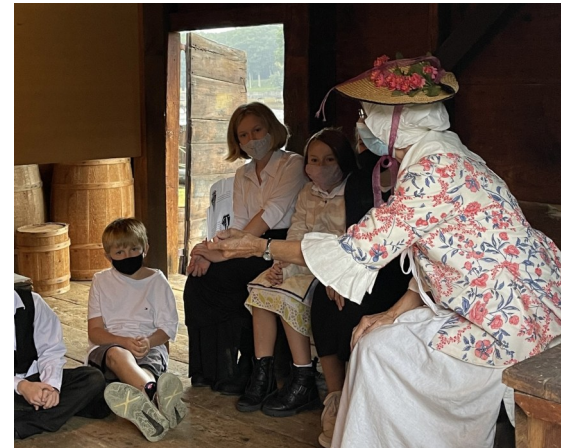
York Living History immersive history school tours for York fifth graders returned in 2021 after a year-long hiatus.