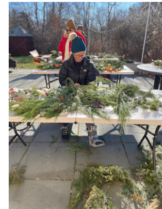
Yuletide Wreathmaking Workshop