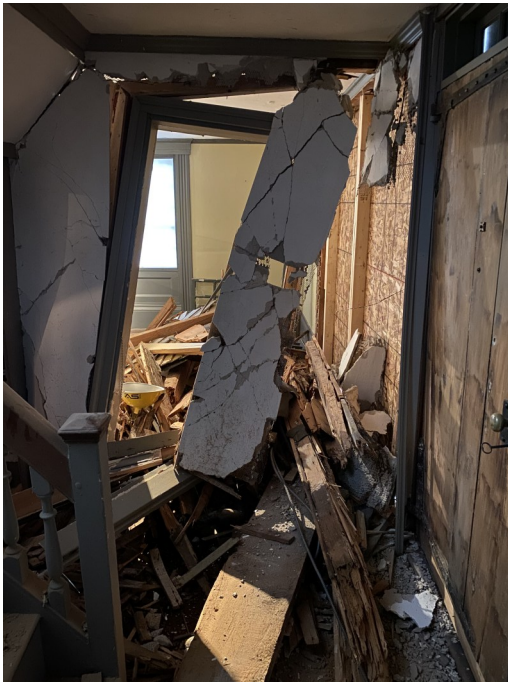
Damage to the Lindsay Road hall of the Emerson-Wilcox House as a result of a 2021 Memorial Day weekend automobile accident.

Old York was on the verge of achieving normalcy following the closures and disruption of the COVID-19 pandemic. Our historic buildings were set to open on Memorial Day, May 31. Tragically, two days before opening, on May 19 the Emerson-Wilcox House Museum was struck by an automobile, causing extensive damage. The house was closed indefinitely, but Old York opened on Memorial Day and had a successful season with the return of visitors, school tours, and the fall Perkins Fundraiser Party.