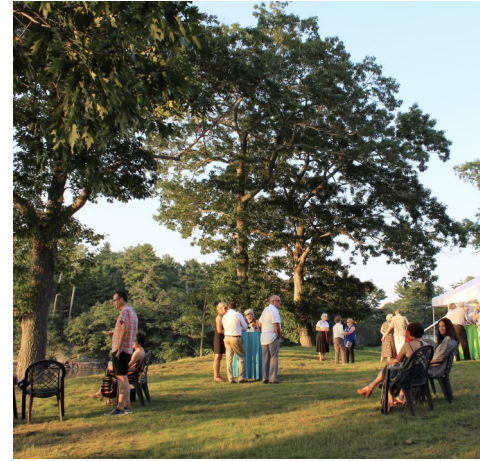
Attendees at the 2021 in-person Perkins Fiesta by the River fundraiser enjoyed food, libations, a little history, and views of the York River.