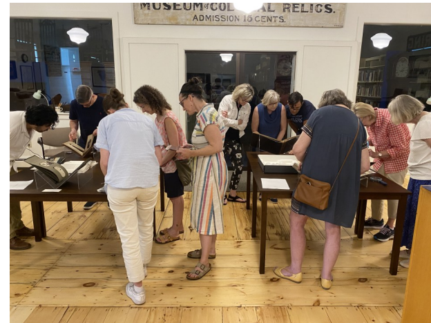
One of the 2023 programs at the new