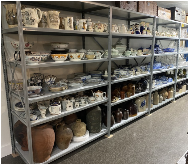
Old York's artifact and archival collections are now accessible in the new Beech Ridge facility in York.

The culmination of nearly a decade of planning and strategic moves, Old York opened the Beech Ridge Collections center in 2023. The new facility brings object and archival collections back to York from a facility in Kittery. The building, the former Beech Ridge Road Assemblies of God church originally was the York and Kittery Christian Society, built in 1867. The 13,000 square feet facility, nearly double the previous building, is ideal for housing Old York's extensive collections, and for providing access to the York Community and outside scholars.