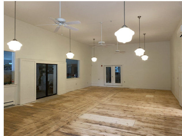
Before and After: The interior of the original 1867 York and Kittery Christian Society Church, after 1985 used as the lobby of the Beech Ridge Road Assemblies of God. Old York uncovered original flooring in the room that now is the archival reading room.