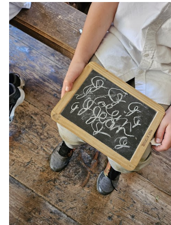
Writing on a Slate, York Living History 2023