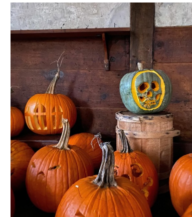
Pumpkins Waiting for the Lighting.